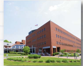
IMG's World Headquarters Indianapolis, Indiana USA

At IMG, we know that the reasons to travel abroad are many and varied - that's why our products are too. Our full-service approach to providing international medical insurance products includes servicing vacationers, those working or living abroad for short or extended periods, people traveling frequently between countries, and those who maintain multiple countries of residence. To meet all of these needs, we have developed a comprehensive range of major medical, life, dental and disability products that can be tailored to meet individual specifications.